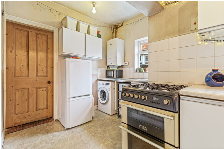
KITCHEN 12'10" x 8'3" max (3.93 x 2.52 max) Fitted units with worktops and tiled splashbacks, sink with drainer, 'Worcester' boiler, plumbing for washing machine, space for fridge freezer, gas point, radiator, two windows to side aspect.