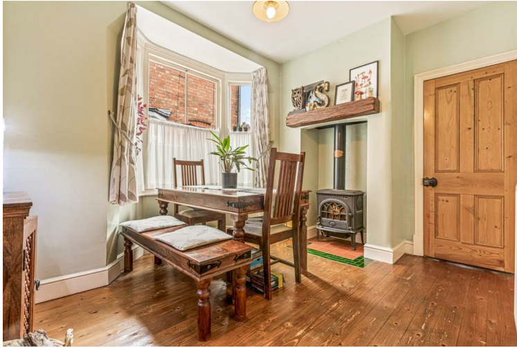
DINING ROOM 10'1" to bay x 11'8" (3.09 to bay x 3.57) Solid fuel log burner, radiator, bay window to side aspect.