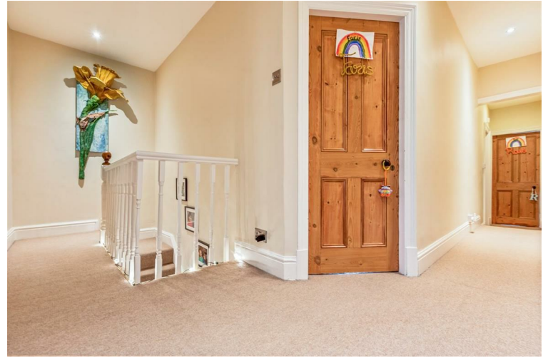
LANDING Access to loft, radiator, spotlights.