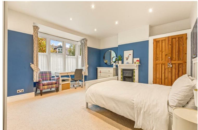
BEDROOM ONE 14'11" to bay x 12'10" (4.57 to bay x 3.93) Cast iron fireplace with wooden surround, fitted wardrobe, picture rail, radiator, spot lights, double glazed bay windows to front aspect.